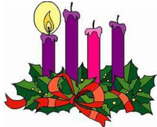
1 st Sunday of Advent