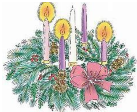
Third Sunday of Advent